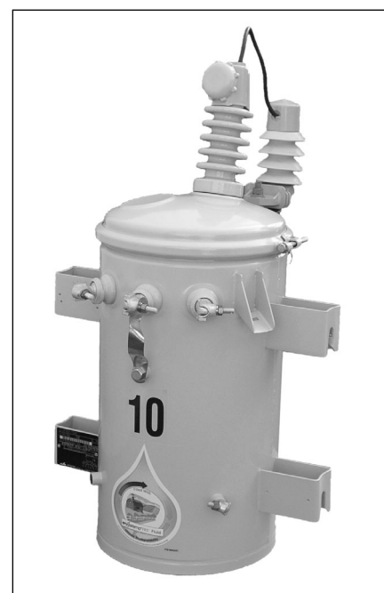
Figure 2. Single-bushing Envirotran EF transformer, shown with optional arrester and hand wheel bird guard.