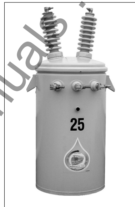
Figure 1. Two-bushing Envirotran EF transformer.