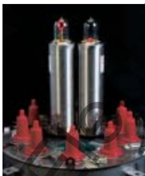
VACop I - A 240V, ac, linear electric motor operator.

There are four basic operators which can be coupled to any operating shaft on a VACpac switch. These operators may be used singly or in combination, depending on the switching requirements. Consult the Operator Application Guide for assistance. The operators are identified as follows: