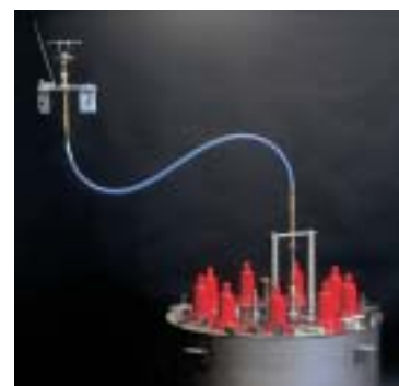
VACop IV - A manual remote cable operator.