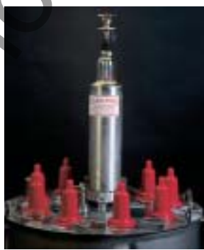
VACop III - A single-shot, "open," stored energy spring operator with manual reset.