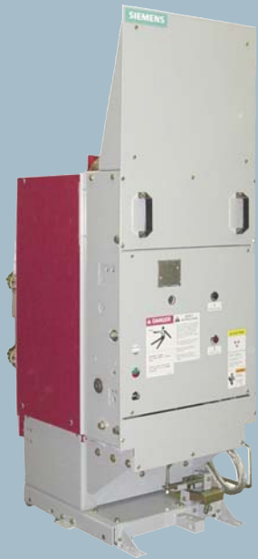
5-DTR2 (Replacement for Federal Pacific DST)