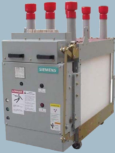
5-AMR (Replacement for Allis-Chalmers AM)

ANSI 5kV at 250–350 MVA, 1200-2000 Amperes