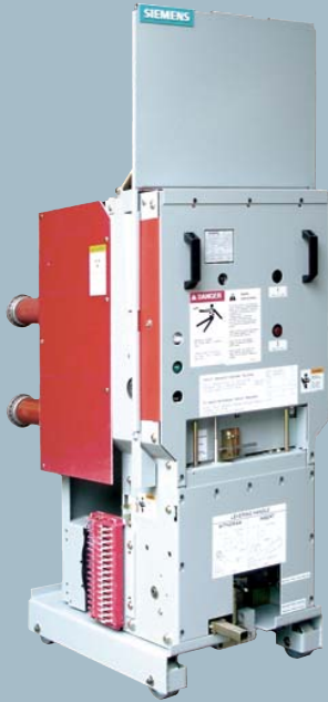
5-MSV (Replacement for Allis-Chalmers MA)

ANSI 4.76/8.25/15kV at 250–1000 MVA, 1200-3000 Amperes