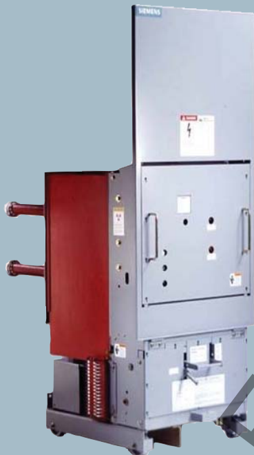
15-FSV (Replacement for Allis-Chalmers FA, FB, FC)