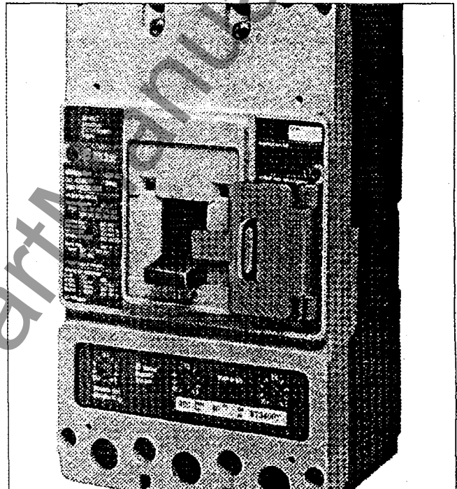
Fig. 1-1 Padlockable Handle Lock Hasp Installed on Series C Circuit Breaker (K-Frame Shown)

This instruction leaflet (IL) gives detailed procedures for installing the padlockable handle lock hasp.