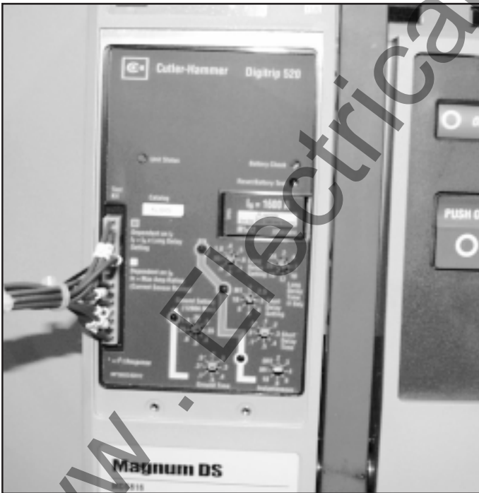
Figure 4. Trip Unit Face Plate Showing Test Port Connection