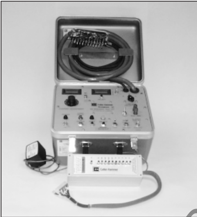
Figure 2. Test Kit and Adapter