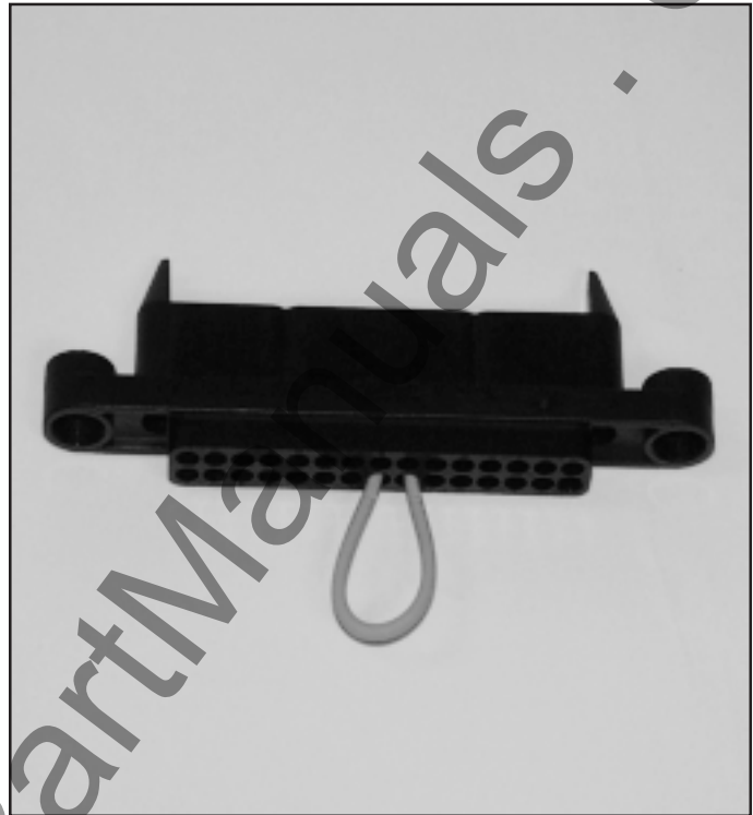
Figure 3. Zone Interlock Shorting Plug